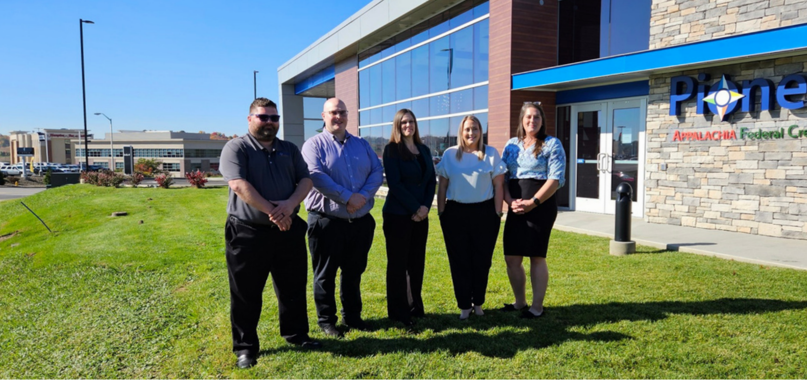
Our dedicated team at our Pioneer AFCU Morgantown Branch

The newest addition to the Pioneer AFCU family is our Morgantown branch. Since its grand opening a few short months ago, this branch has swiftly become a cornerstone of our expansion and a beacon of our commitment to community and service.